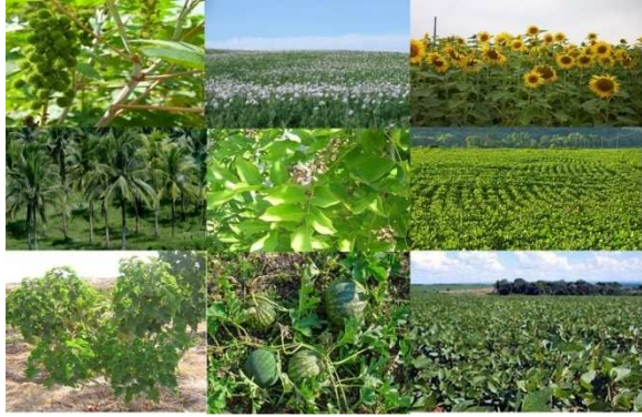
Figure 3 Biofuel Plants

The oil from oil-bearing and oil-producing plants is regularly concentrated primarily in the fruits and seeds. The roots, stalks, branches, and leaves may also contain some oil but, in general, the quantity is very much lower. The oil content of some seeds and fruits can be as high as 35%. For example, in dried coconut meat (commonly termed copra) the oil content can be as much as 60 to 65%. In several seeds the oil is mainly found in the germ or embryo, which generally constitutes only a small part of the seed. In the case of the olive, however, a major portion of the oil is found in the pulp surrounding the kernel and only a small portion in the kernel itself. But in the case of the oil palm, both the pulp and the kernel include large amounts of oil. In general, the oil from the pulp may have characteristics somewhat different from the fat from the kernel.